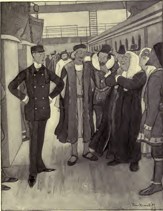
JUDGE BLACKSTONE REFUSES TO CLIMB TO THE MIZZENTOP